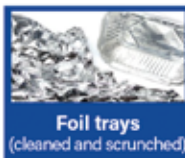
Foil trays (cleaned and crumpled)

Please wash and squash your items and replace tops and lids on bottles and jars to keep recycling clean and dry.