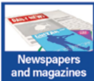
Newspapers and magazines