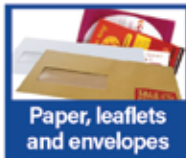
Paper, leaflets and envelopes