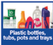
Plastic bottles, tubs, pots and trays