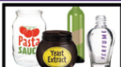
Mixed glass (bottles and jars, rinsed)

Your guide to recycling at home in Newcastle