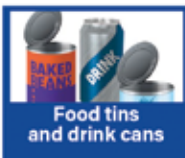
Food tins and drink cans